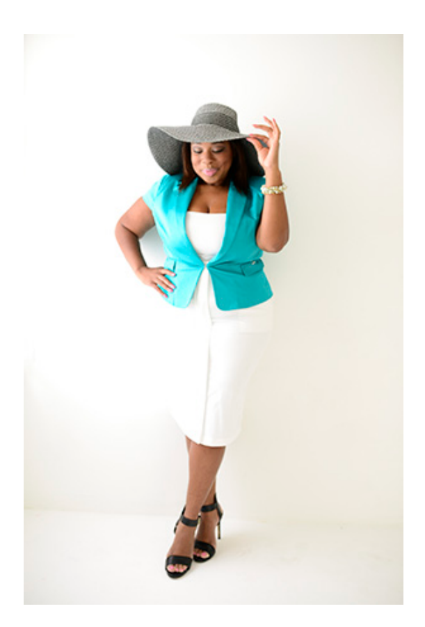
This lifestyle blog is an outlet to share personal style, beauty tips, travel adventures and much more. So excited to share with you!

In our 2016 Awards Show Season LA Travel Guide to Hollywood , we focus on room specials and Oscar viewing parties at both historic and brand new Hollywood hotels. Where do the stars stay, dine and play in