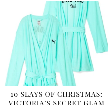
VICTORIA'S SECRET GLAM December 18, 2015

GET READY FOR THE 2015 BET AWARDS WEEKEND June 18, 2015