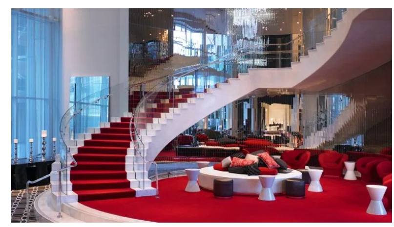
The dramatic red carpeted lobby and spiral staircase at W Hollywood Hotel.

W Hotel Hollywood has an enviable location right down the street from The Dolby Theatre almost at the famous Hollywood and Vine intersection. The hotel is known for livestreaming its annual Oscars Live & Loud Viewing Party, which even includes a Tweet Suite with mini massages. This fantastically-decorated hipster hotel attracts celebrities to its jaw-dropping Wow, E-Wow, Cool Corner, Fantastic and Marvelous suites.