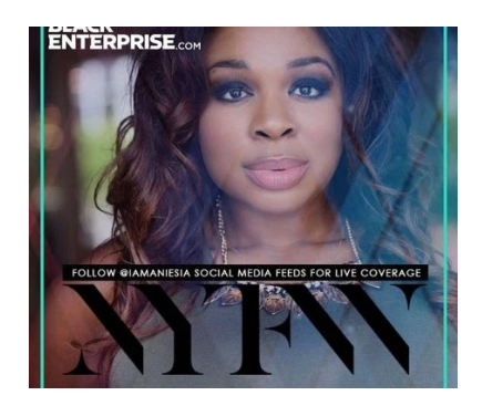
NYFW SS16 ESSENTIALS PACKING LIST September 11, 2015